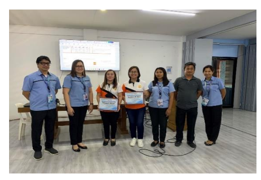
"Magna Carta of Women and Gender Sensitivity Orientation"

The Office of Gender and Development conducted a seminar-workshop on Gender Sensitivity and Magna Carta of Women for the Dueg Resettlement Entrepreneurs and Marketing Association (DREAM) of Sitio Dueg, San Clemente, Tarlac on June 21, 2024.