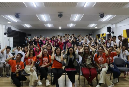
OGAD-OHRDM Partnership in the "Gender Sensitivity Orientation for Newly Hired Employees"

A Gender Sensitivity Orientation for newly hired employees of the institution took place on January 17-18, 2024, at the TSU CET-AVR, in keeping with the TSU-Gender and Developments Office's goal of promoting gender-consciousness-raising, advocacy and affirmative action, and information dissemination. The purposeful event was organized and led by the Office of Gender and Development I collaboration with the Office of Human Resource Development and Management.