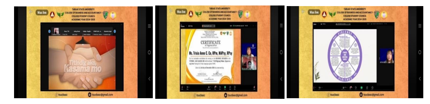
"RA 11313 The Safe Spaces Act (Bawal Bastos Law)" Webinar

The TSU – Guild of Elementary Mentors in partnership with the TSU – Office of Gender and Development conducts a webinar titled "RA 11313 The Safe Spaces Act (Bawal Bastos Law)" on December 09, 2024, via Zoom.