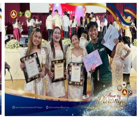
"Fostering a Gender-Inclusive Environment and Leadership" Seminar

The TSU – Junior Financial Executives in partnership with the TSU – Office of Gender and Development conducted a leadership seminar with the theme "fostering a Gender-Inclusive Environment and Leadership on July 29, 2024 at the TSU Main AVR.